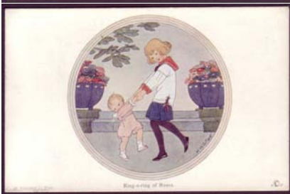
Auntie's Little Rhyme Book Ring-a-ring of Roses