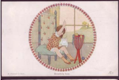
Nursie's Little Rhyme Book Dressing dolly