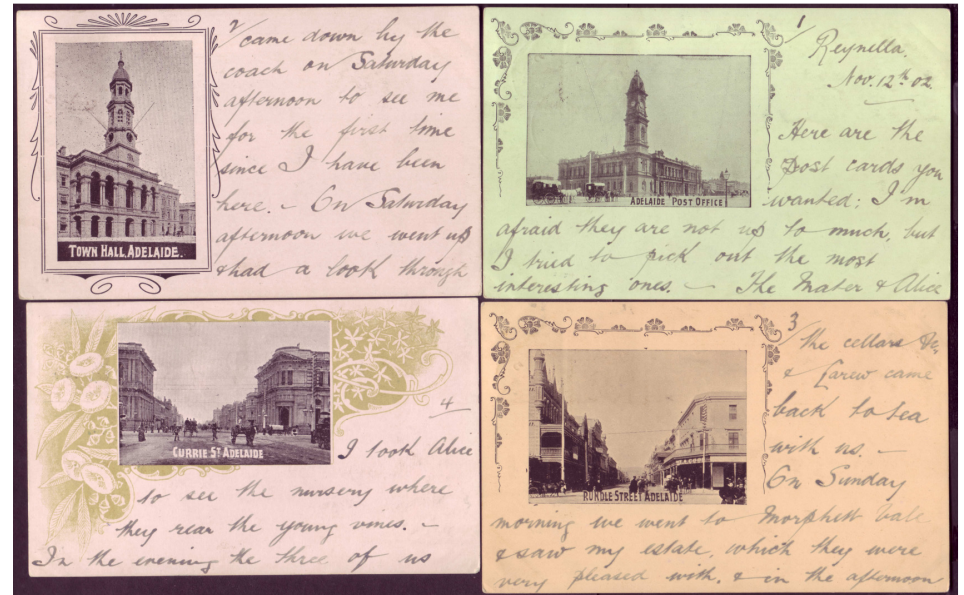
The first 4 cards containing a letter spread over 12 different Ziegler cards.