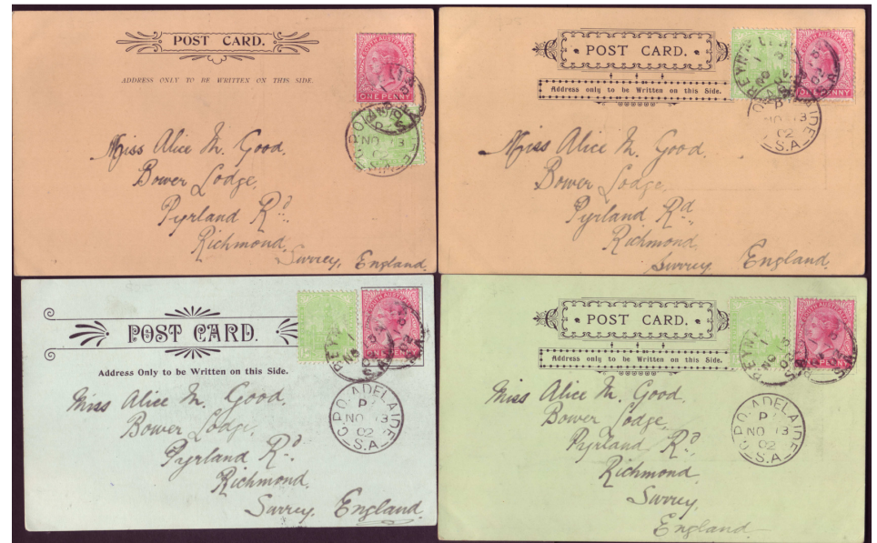
The backs of the 4 cards above showing three different styles.