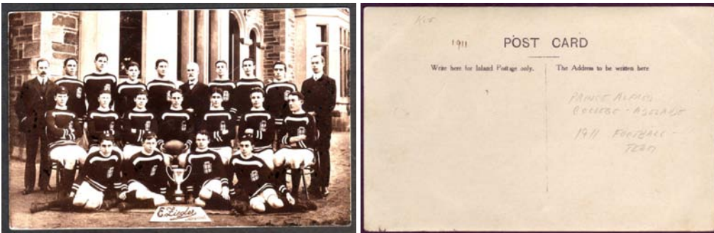
Prince Alfred College Football Club for 1911 with yet another type of back.