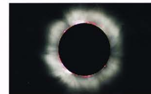
Total Solar Eclipse 2012 CAIRNS - PORT DOUGLAS

WEBSITE ADDRESS: australian-postcard-society.com