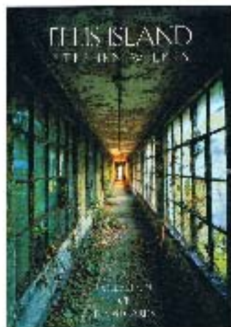
Cover from the postcard collection showing Corridor 2, Ward 2.