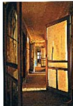
NURSES' QUARTERS, ISLAND 3 In the nurses' sleeping quarters across doors were open at various angles, creating an almost mystical pattern in the space. It was designed to allow the chief to open a general tuberculosis and infectious diseases.