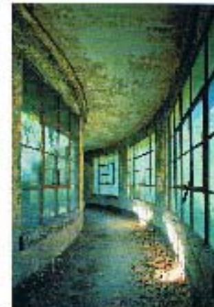
ISOLATION WARD, CORRIDOR CORRIDOR 2 The corridor meanders from the hospital to the measles ward. An odd geometry rules the corridor. It is curved to engage the reach of backs, but what of the top and what of the bottom? There is confusion — and serenity of blue.