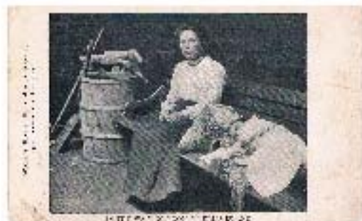
Waiting Room. Published by Women's English Home Mission Society, 2411 Indiana Ave., Chicago.

For many it was an "Isle of Hope" and for some others it became an "Isle of Tears" as they were rejected due to health problems.