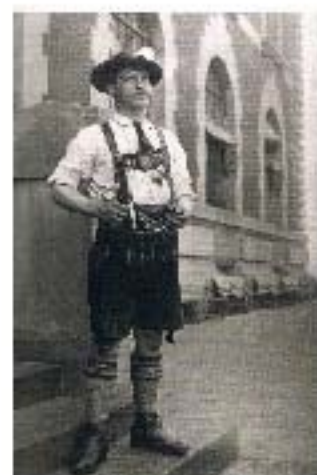
A Bavarian Peasant

A series of ELLIS ISLAND "Portraits of Immigrants" in black and white were Published by The New York Public Library, Astor, Lenox and Tilden Foundations. They were printed by "Pomegranate" Box 808022 Petaluma CA 94975.