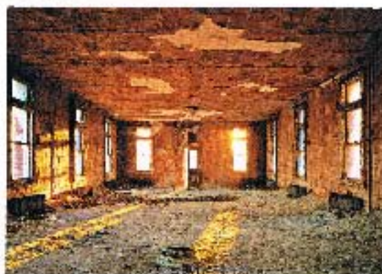
HOSPITAL EXTENSION, WOMEN'S WARD

It felt like a room unmaking itself. The pulverised plaster from the ceiling gave the room, where children with head lice and ringworm once slept, the character of a desert.