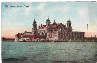
Ellis Island, New York.