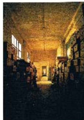
OAK FILE CABINET'S MEASLES WARD They see the records of those who passed through the hospital, a juggler of file cabinets in decay. In the foreground - see the goal - the files - and in the background, the present - a void opening endlessly into the distance.

In 1965 President Lyndon B Johnson designated Ellis Island as a part of the Statue of Liberty National Monument