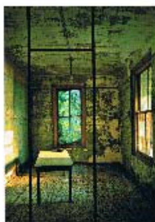
ADMINISTRATION OFFICE, ISLAND 3 This room never received direct sunlight except at a single moment each day, 2.15pm—the precise moment the Photographer captured the shot.