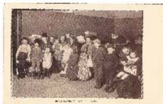
Detention Room. Unknown publisher

A series of ELLIS ISLAND "Portraits of Immigrants" in black and white were Published by The New York Public Library, Astor, Lenox and Tilden Foundations. They were printed by "Pomegranate" Box 808022 Petaluma CA 94975.