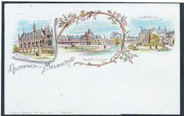
8. Glimpses of Melbourne Wilson Hall Trinity College University Postally used 21 st June 1899 Melbourne