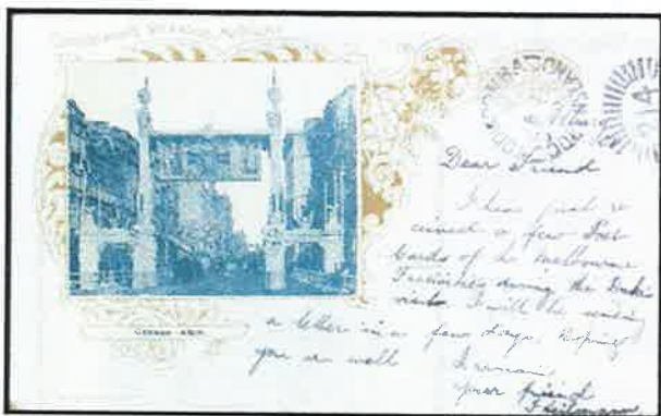
10. Front With Mc Carron Stewart & Co., Print Sydney, 1st January 1902 Description : The Arch erected by the German Community in honour of the Commonwealth 1901

was a powerful image and one that sent ambiguous messages to the Australian colonists uniting in a federation that day.