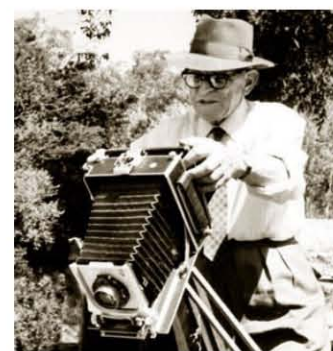
Frank Hurley - refer to page 11

WEBSITE ADDRESS: australian-postcard-society.com