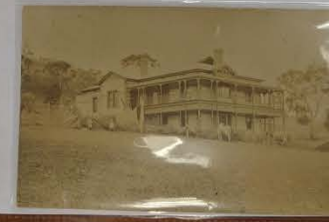
View of 'Nangawooka', the home of the Taylor Family at Victor Harbor.