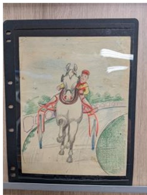
A hand drawn sketch by George White.