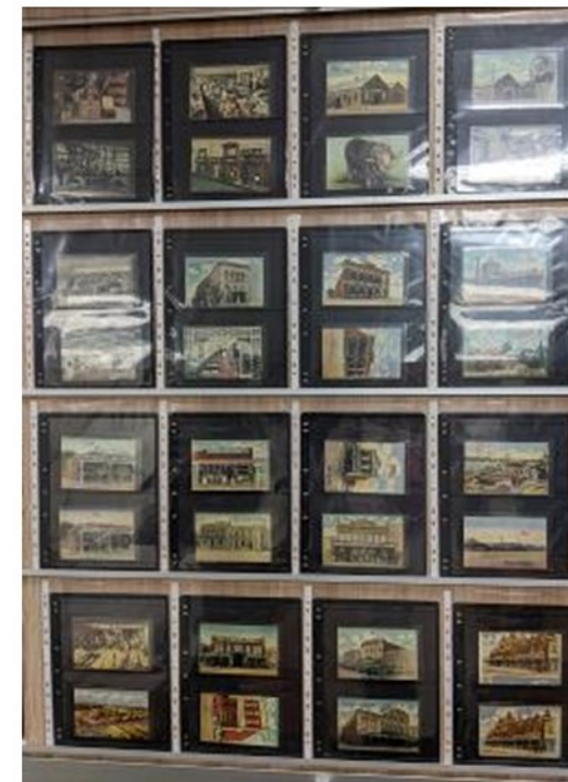
F W Niven

An inspiring collection of postcards covering many topics. From a 2 frame collection from F W Niven of advertising cards of Adelaide with some in colour to The Melbourne Exhibition building, built in 1881, listed on the Heritage List and still standing today. Many organizations have used the building for various functions. Then you have the City of Churches, with many of the old churches not existing any more. You will see a wedding scene outside a North Adelaide Church as well as St Peters Little Chapel