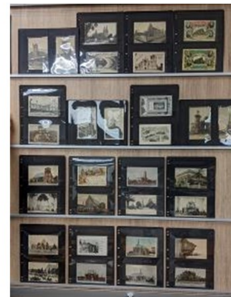
City of Churches