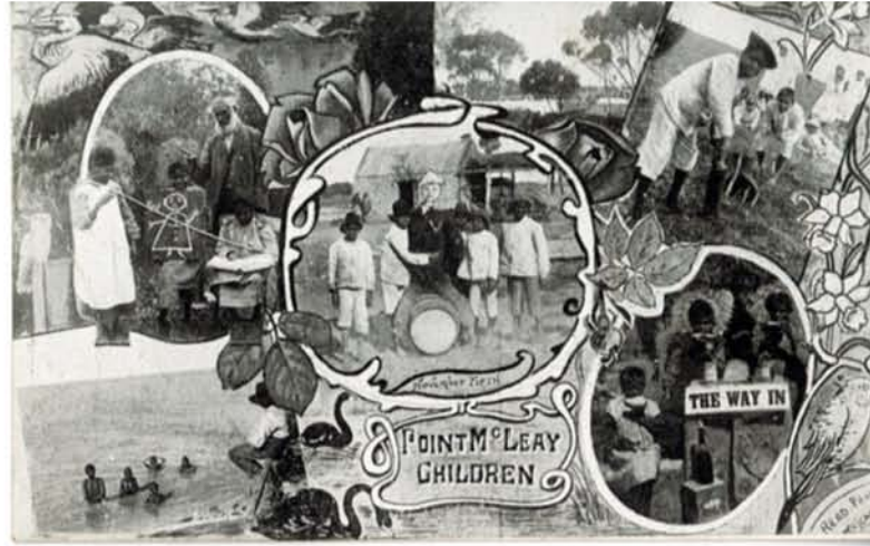
POINT McLEAY CHILDREN Divided Back, Half-Tone Block Read. Photo. McLeay 142mm x 89mm

Aboriginal children being taught biology, celebrating Guy Fawkes Day (November fifth), playing cricket, swimming and eating.