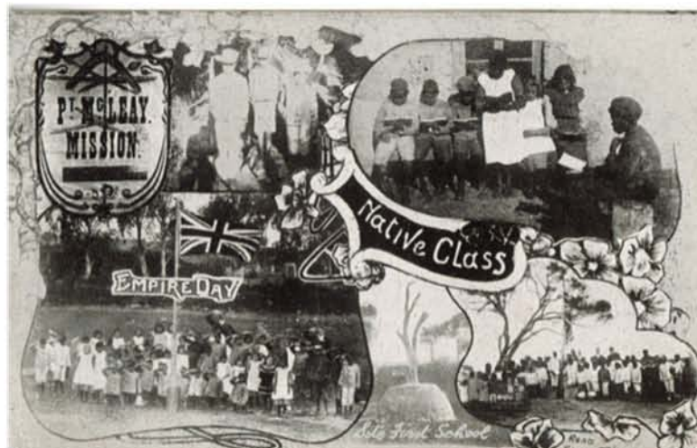
POINT McLEAY MISSION EMPIRE DAY/ NATIVE CLASS Divided Back, Half-Tone Block Read. Photo. McLeay

Aboriginal children celebrating Empire Day, having a reading lesson and the site of the First School.