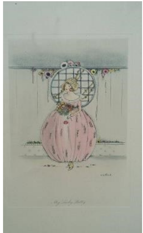
"My Lady Betty"